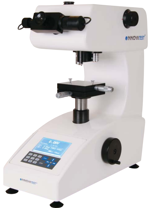
400 DIGITAL MICRO-VICKERS & KNOOP