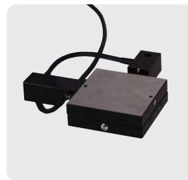
TABLE OPTION 3 SMALL MOTORIZED STAGE