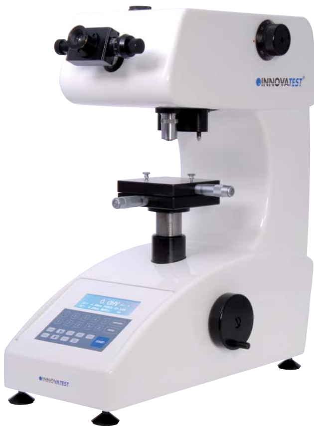
400 ANALOGUE MICRO-VICKERS & KNOOP