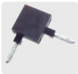
TABLE OPTION 1 ANALOGUE STAGE MICROMETERS