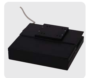
TABLE OPTION 4 LARGE MOTORIZED STAGE