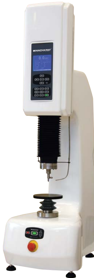
NEXUS 6000 MASTER LOAD CELL, CLOSED LOOP, ROCKWELL/SUPERFICIAL ROCKWELL