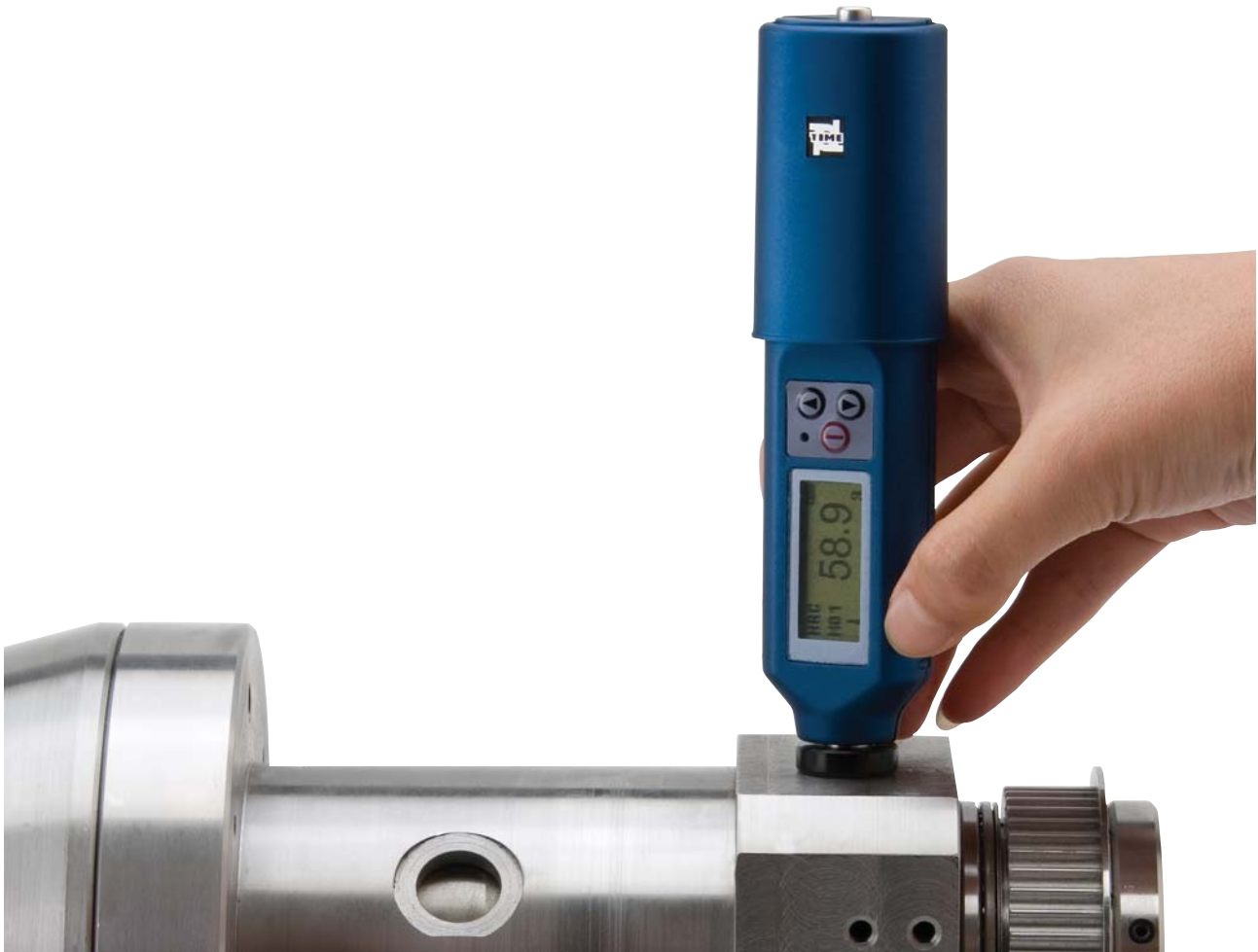
IMPACT TH-1100 PORTABLE LEEB HARDNESS TESTER