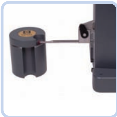
Taking the probe constant value with the setting block (included in standard delivery)