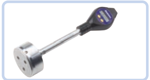
SmartPlug with extension