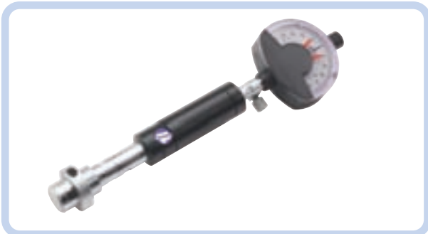
SmartPlug with depth stop