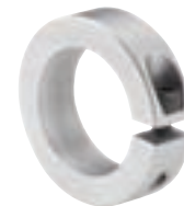
SMPDS00-09 Depth Stop