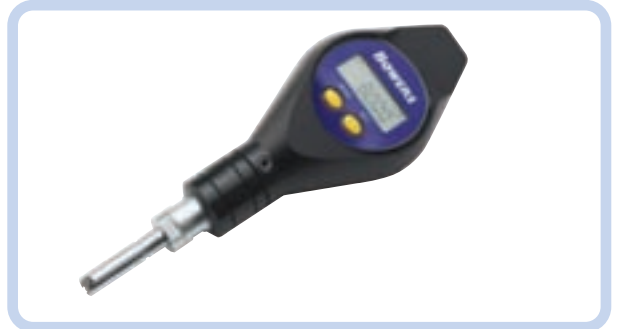
SmartPlug for blind bore measurement