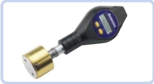
SmartPlug with TiN coated body