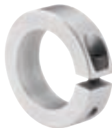
SMPDS00-09 Depth Stop