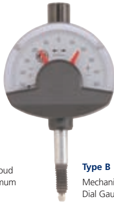
Type B Mechanical Dial Gauge