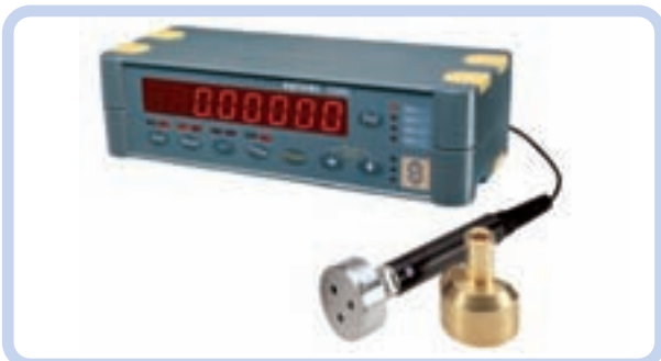
SmartPlug with transducer holder and standalone display