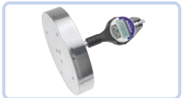
SmartPlug for large diameters (up to 280mm)