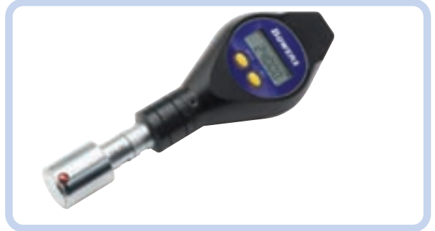
SmartPlug with ruby contacts