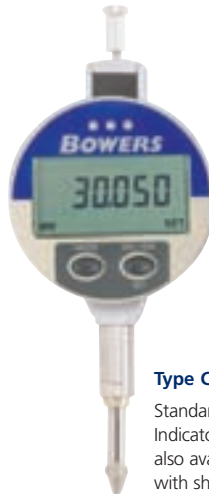
Type C Standard Digital Indicator also available with shroud