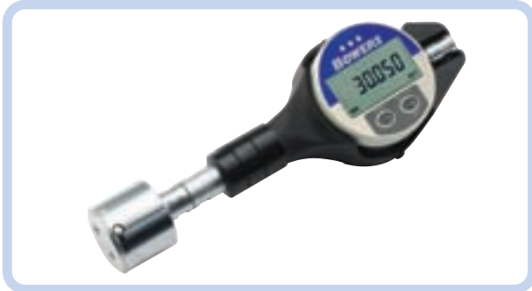
SmartPlug with ceramic contacts