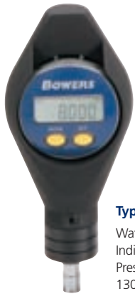
Type A Waterproof MIni Indicator with Shroud Preset value maximum 130mm